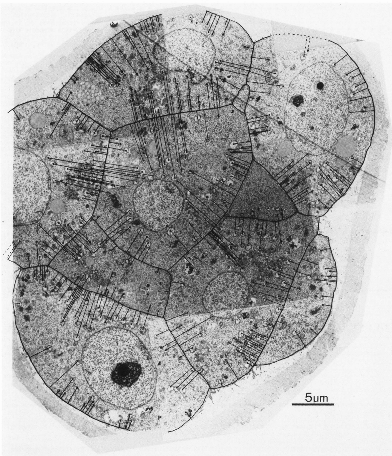
Figure 2. Morphometric analyses at the electron microscopic level: determining the average distance of mitochondria from the basolateral cell borders of mouse morulae. Midsagittal sections of treated morulae were overlaid with tissue paper on which were traced cell outlines. Each mitochondrion was identified by a dot. Dots were connected to the nearest cell border by straight lines, which were then measured, averaged and subjected to statistical analyses.